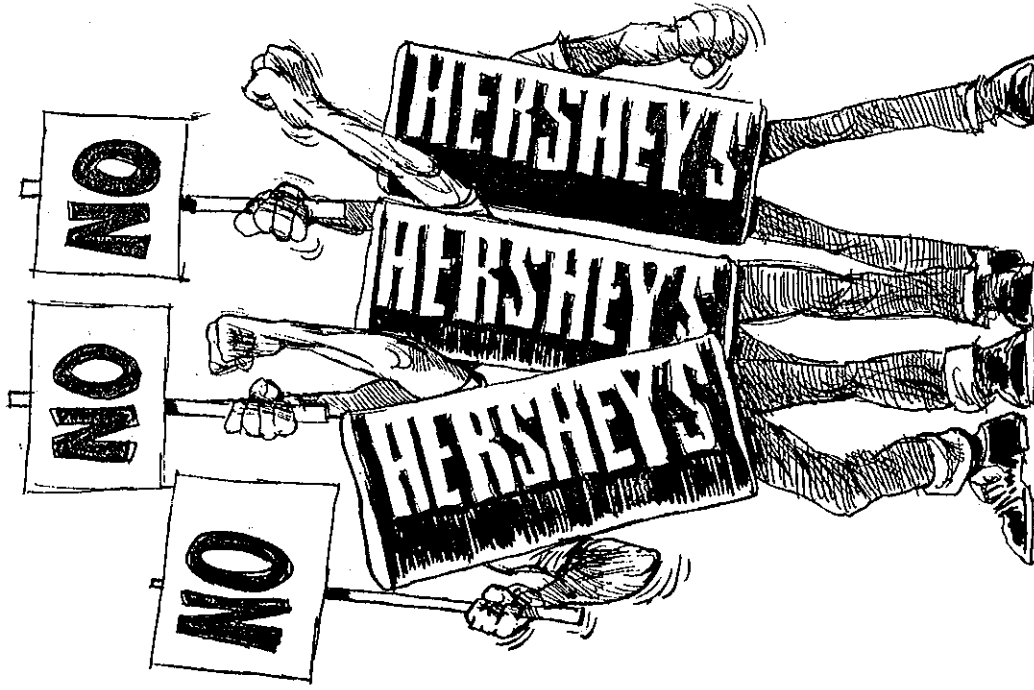
HERSHEY BARS PROTEST

WOMEN'S MOVEMENT CALLED MORE BROAD-BASED